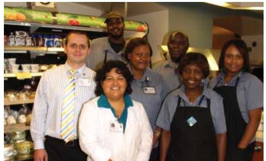
The Summit Cafeteria Staff